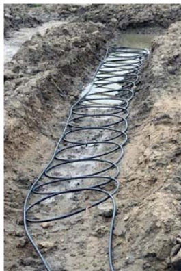
Geothermal coils, part of the Dining Hall Geothermal System