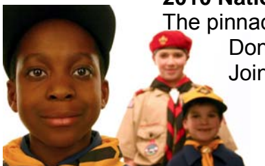
TRUSTWORTHY Loyal HELPFUL Friendly COURTEOUS Kind