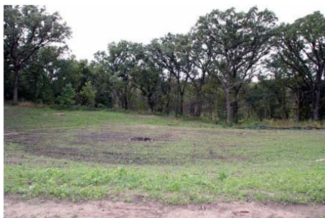
Future site of the Camp Amphitheater, fire bow utilized by 2009 OA Conclaves.