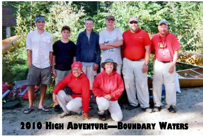
2010 HIGH ADVENTURE—BOUNDARY WATERS