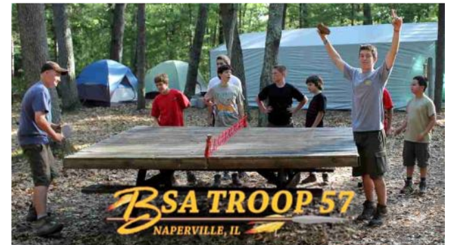
BSA TROOP 57 NAPERVILLE, IL