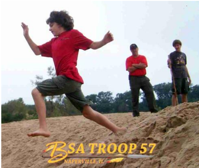
BSA TROOP 57 NAPERVILLE, IL